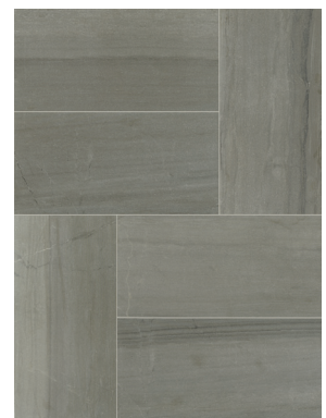
AV305 ▶ Apollo HON