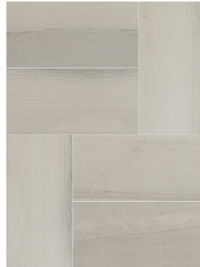
AV304 ▶ Gemini UPS