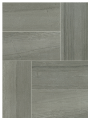
AV305 ▶ Apollo UPS