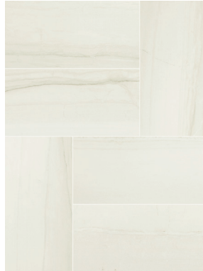
AV301 ▶ Juno HON