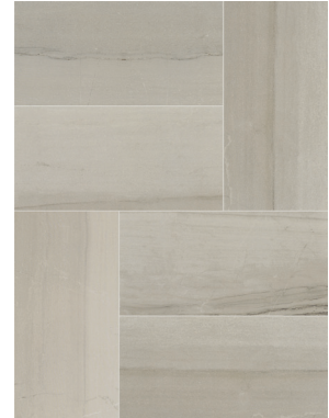
AV304 ▶ Gemini HON