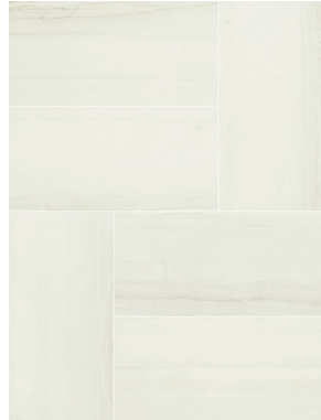
AV301 ▶ Juno UPS