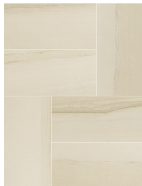
AV303 ▶ Kosmos UPS