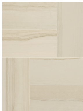
AV303 ▶ Kosmos HON