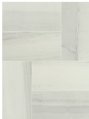
AV302 ▶ Luna HON