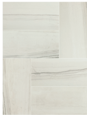
AV302 ▶ Luna UPS