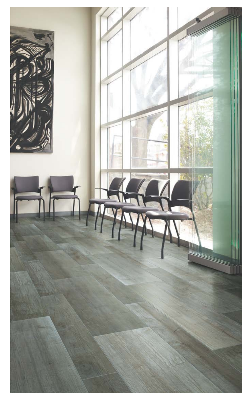
From our progressive manufacturing practices, to our award-winning green tile innovations, to our commitment to improving the everyday experiences of our employees, customers and partners, Crossville is—and always has been—the industry leader in sustainability.