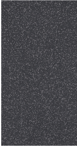
AP880 ▶ Onyx