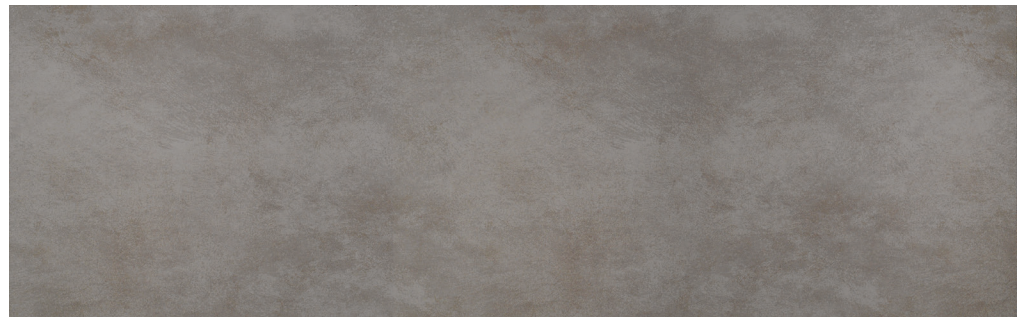
Grigio - L2581 - 3+ (Walls) - Stocking