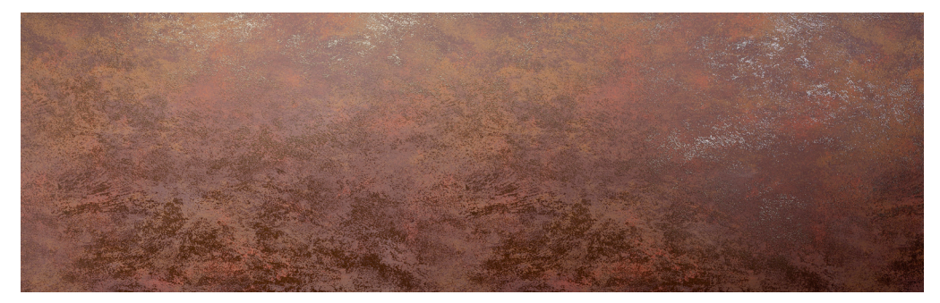
Moro - L1462 - 3+ (Walls) - Stocking

Due to DCOF value, these tile panels are not recommendedfor applications in wet areas or areas where standing water may occur.