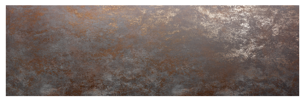
Nero - L1461 - 3+ (Walls) - Stocking