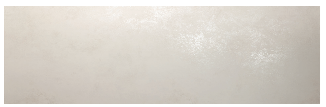
Avorio - L2012 - 3+ (Walls) - Stocking