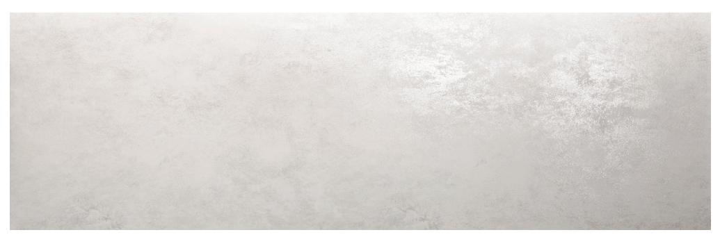
Perla - L2013 - 3+ (Walls) - Stocking