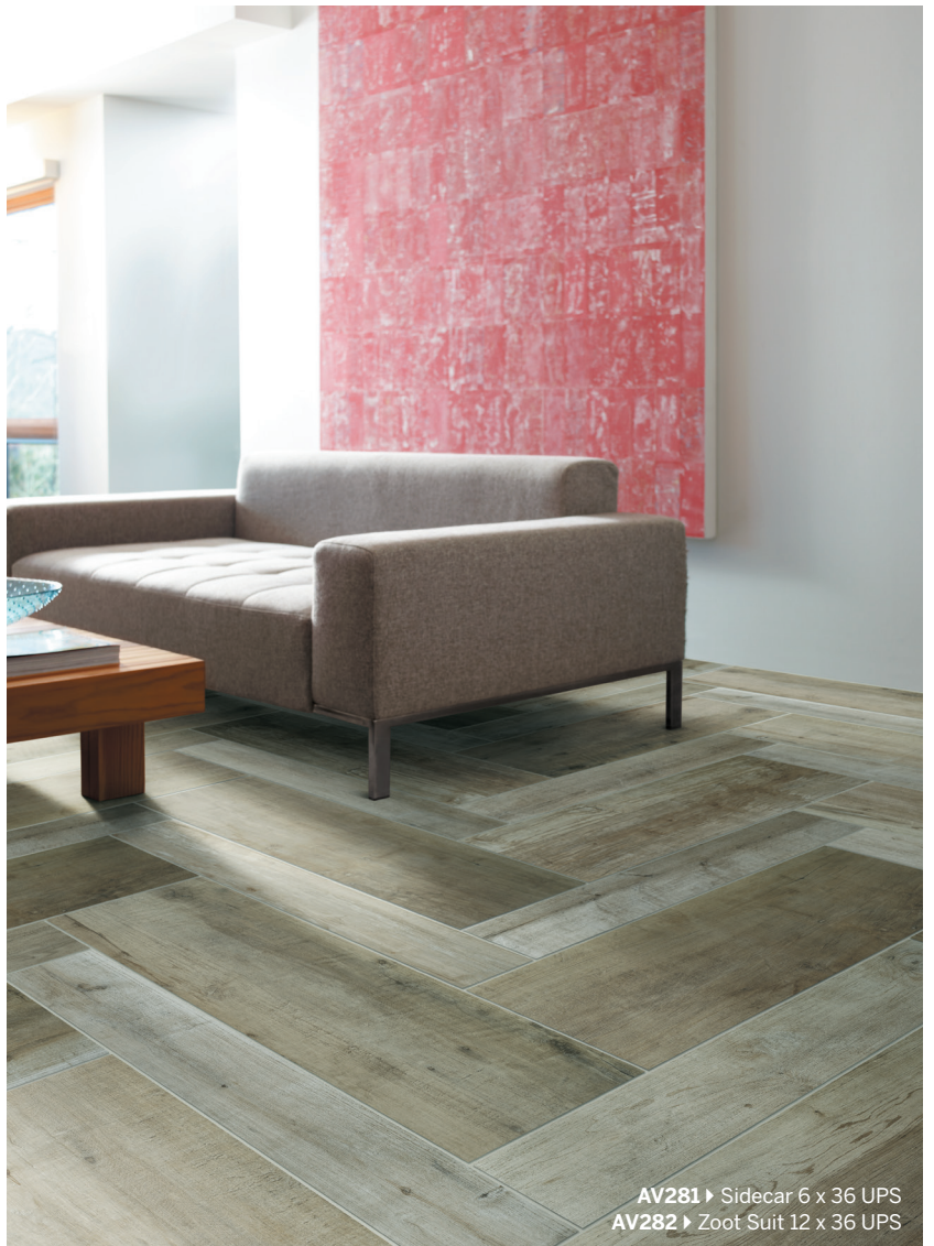
AV281 ▶ Sidecar 6 x 36 UPS AV282 ▶ Zoot Suit 12 x 36 UPS