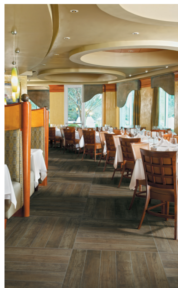
AV285 ▶ Bankroll 6 x 36 UPS