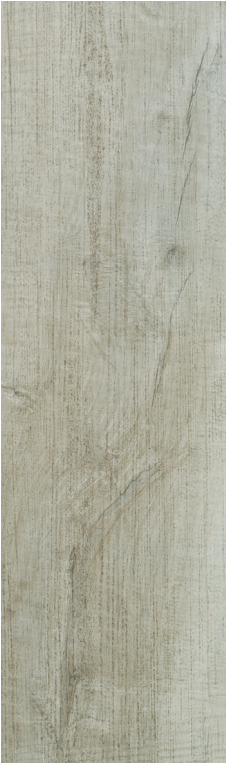
AV281 ▶ Sidecar