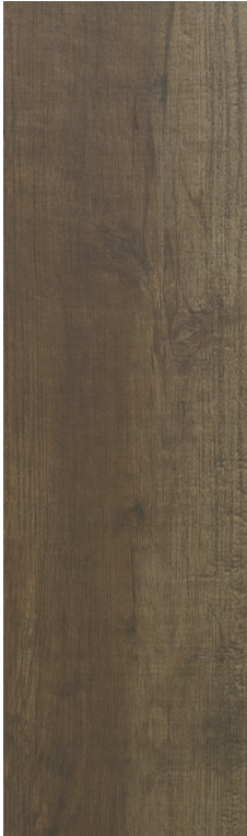
AV285 ▶ Bank Roll