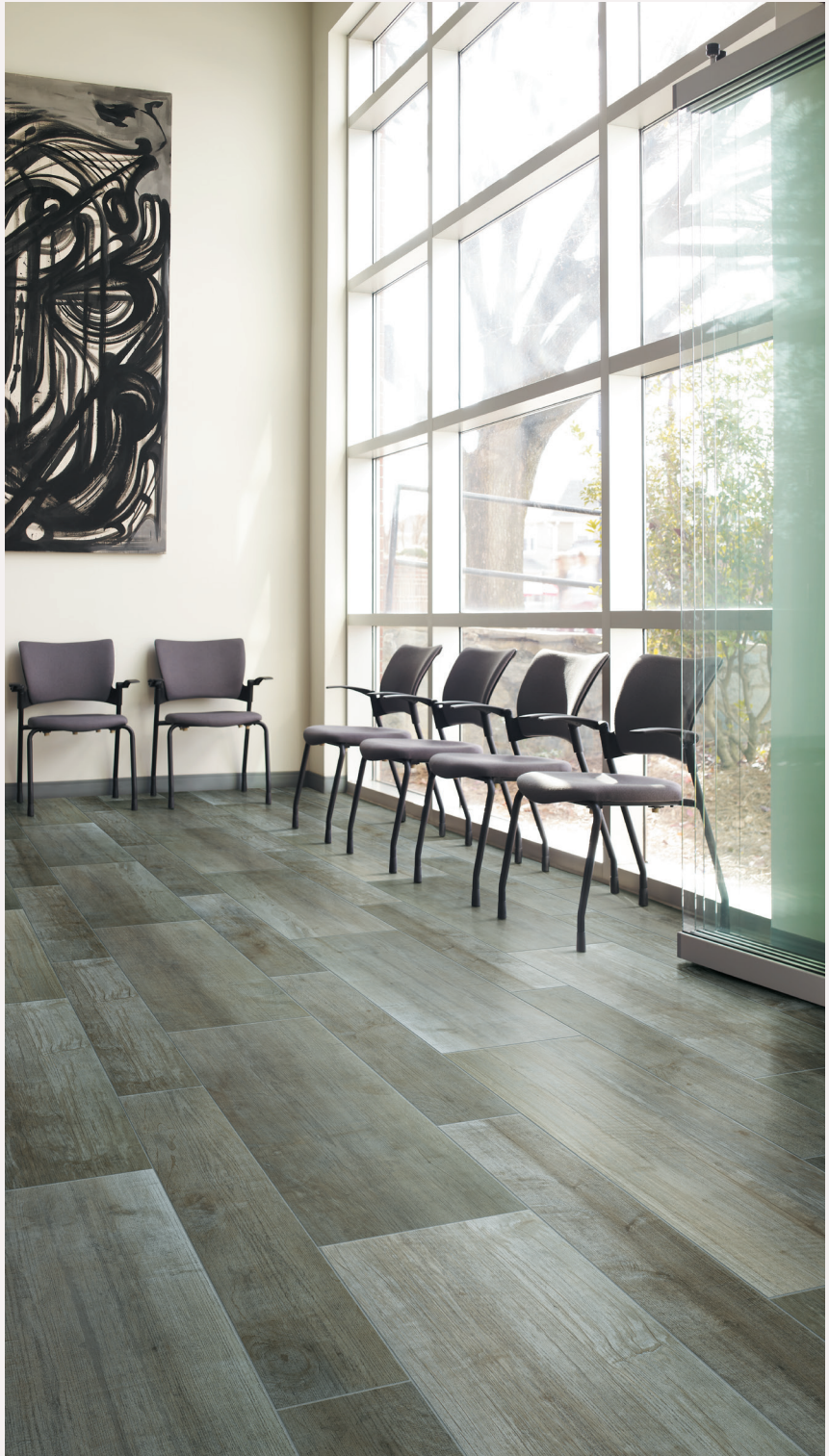
AV284 ▶ Silver Screen 6 x 36 and 12 x 36 UPS