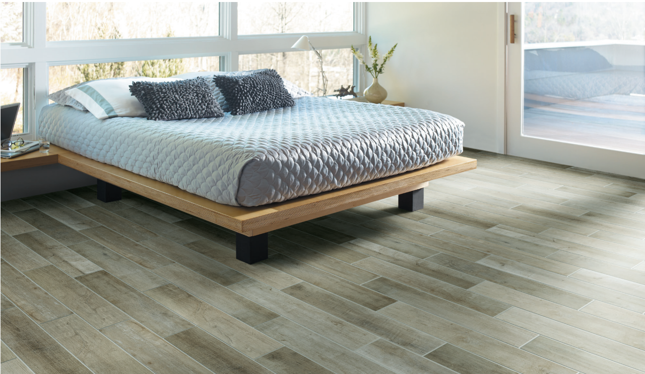
AV281 ▶ Sidecar 6 x 36 UPS