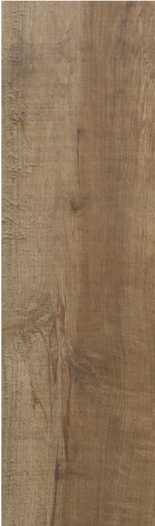
AV283 ▶ Sweet Georgia Brown