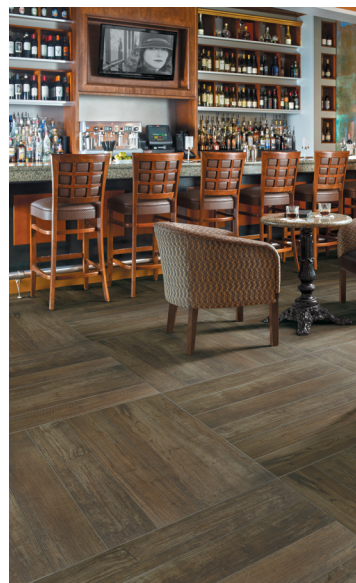
AV285 ▶ Bankroll 6 x 36 UPS