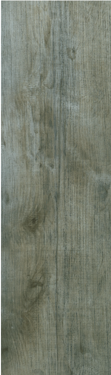
AV284 ▶ Silver Screen