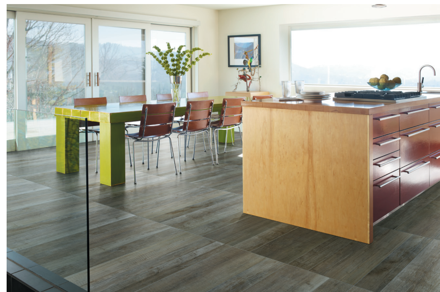
AV284 ▶ Silver Screen 6 x 36 and 12 x 36 UPS

This porcelain tile product is produced with a V3 variation. Inspect the product upon delivery and for best results, blend tile from several cartons during installation.