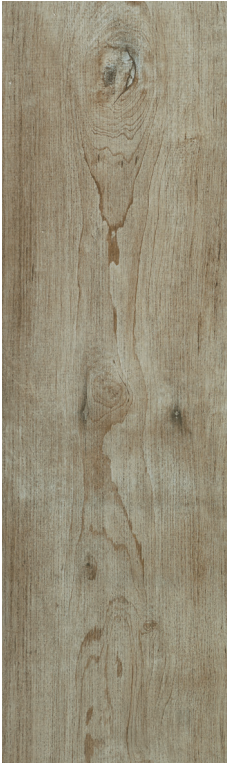
AV282 ▶ Zoot Suit