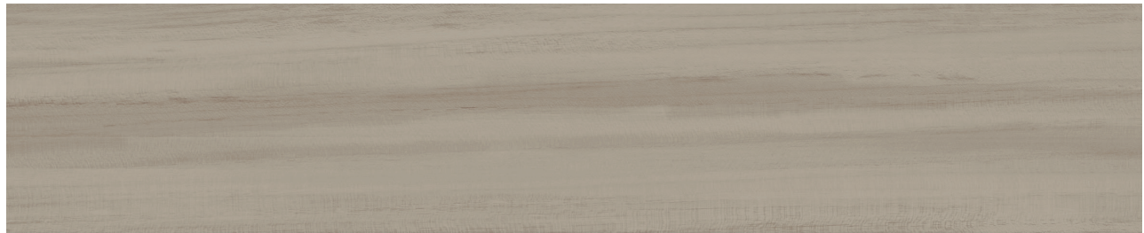
RLX03 ▶ Woolen