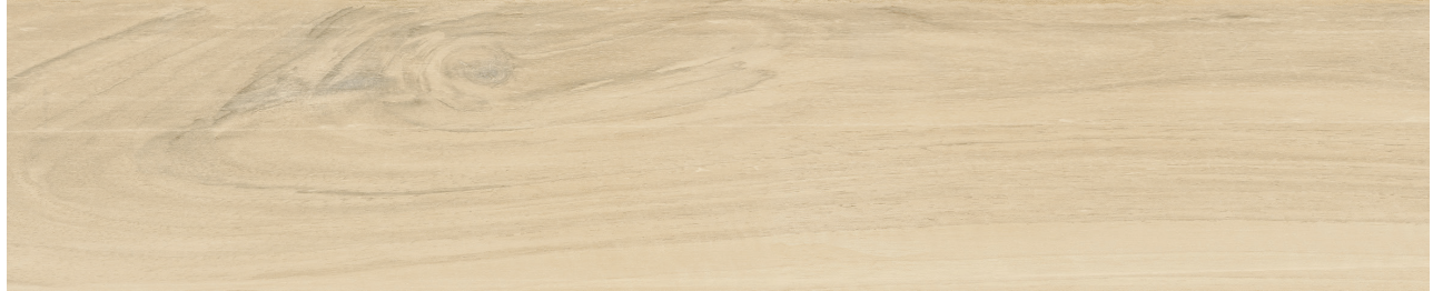
RLX01 ▶ Chiffon