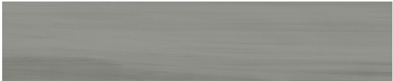
RLX04 ▶ Caviar