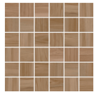
2 x 2 Square Mosaic UP Finish (Mounted on a 12 x 12 sheet.)