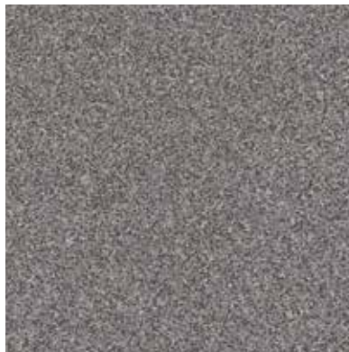
A850 ▶ Graphite