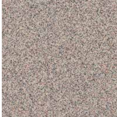
A675 ▶ Stonehenge