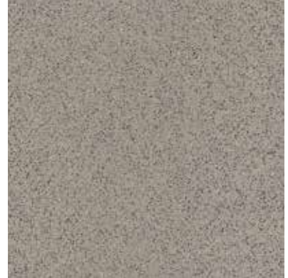
R001 ▶ Grey Mingle