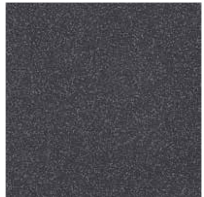
A880 ▶ Onyx