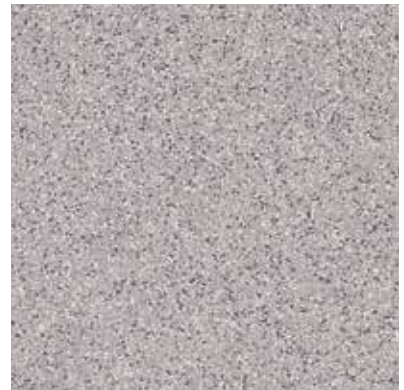
A900 ▶ Mica