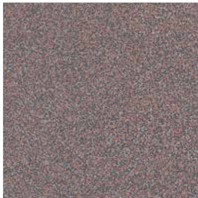
A790 ▶ Burgundy Smoke