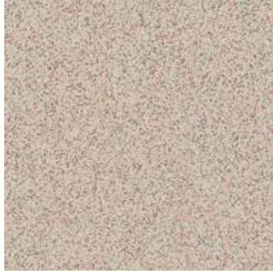
A233 ▶ Sand Bisque