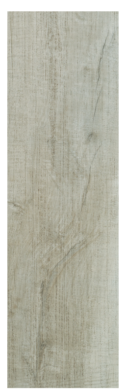
AV281 ▶ Sidecar