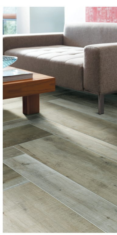
AV281 ► Sidecar 6 x 36 UPS AV282 ► Zoot Suit 12 x 36 UPS

Regular cleaning is the best way to keep SpeakEasy tile looking good for years to come. Use clean, hot water (combined with a household cleaner for more aggressive cleaning). Rinse thoroughly and dry with a soft cloth. No waxes are needed. More information regarding the care and maintenance of Crossville® products is available at CrossvilleInc.com.