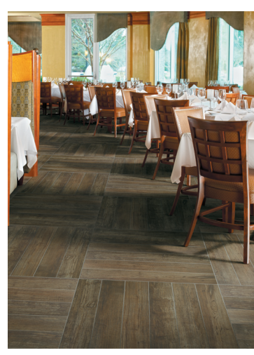
AV285 ▶ Bankroll 6 x 36 UPS