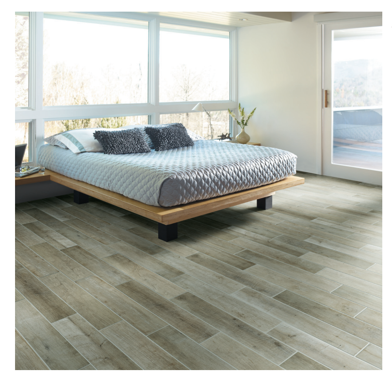
AV281 ► Sidecar 6 x 36 UPS