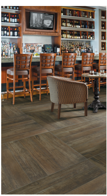
AV285 ▶ Bankroll 6 x 36 UPS