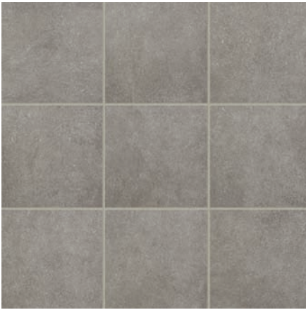
AV214 Gallery Grey 20% pre-consumer recycled content*