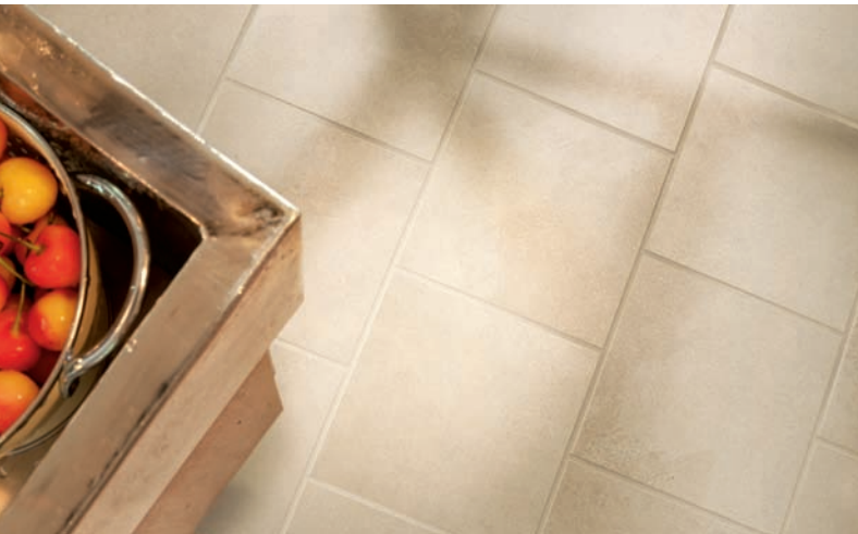
Products featured in photo above: AV211 Cinema Champagne 12" x 12"