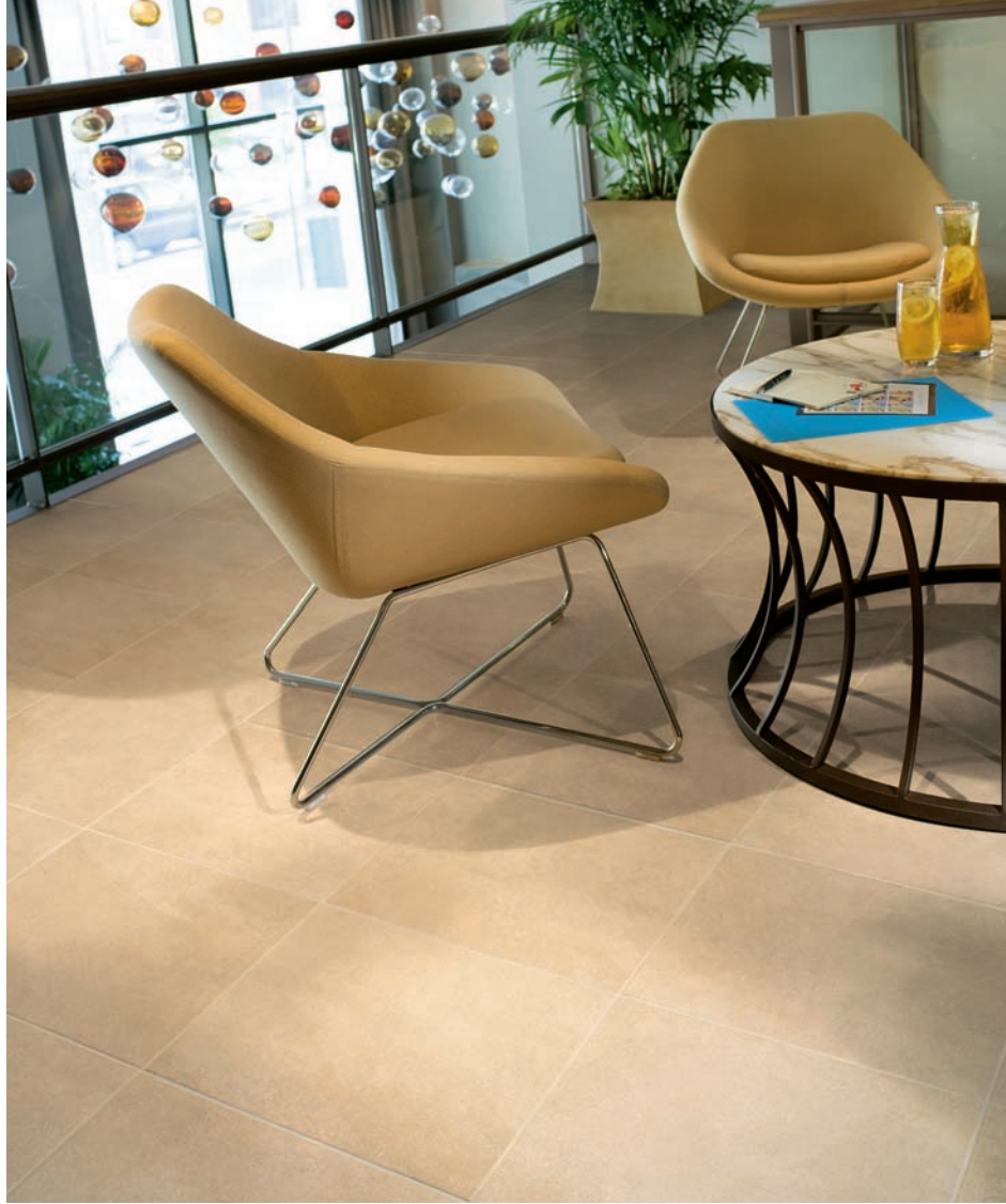
Product featured in photo above: AV212 Café Caramel 18" x 18"

High COF and low maintenance ideal for commercial settings