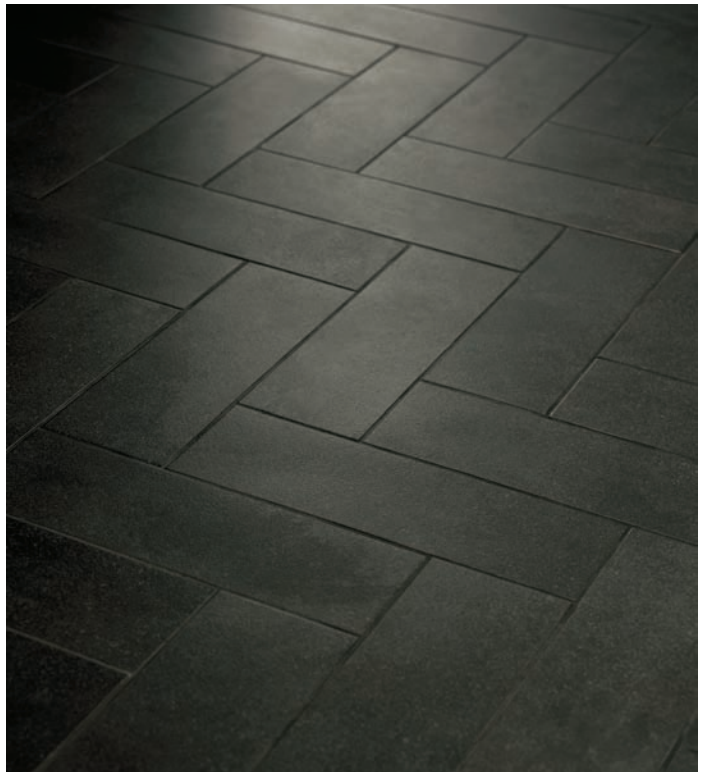
Product featured in photo at right: AV215 Boutique Black 6" x 18"