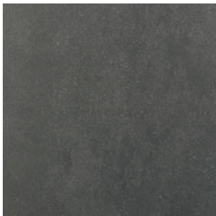
18" x 18"