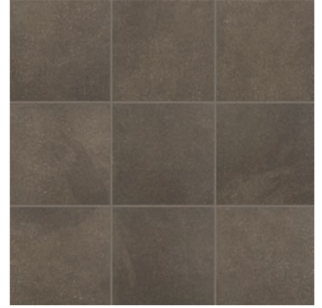
AV213 Bistro Brown 20% pre-consumer recycled content*