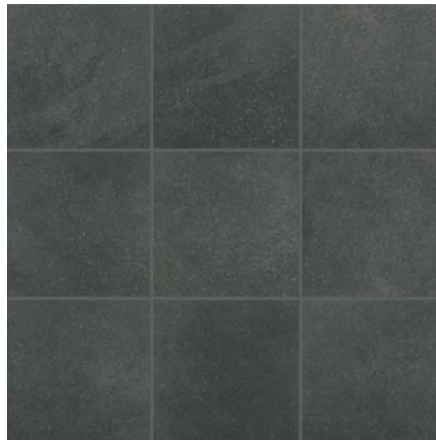
AV215 Boutique Black 20% pre-consumer recycled content*

*Note: This product contains pre-consumer recycled content. Percentage varies by color.