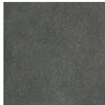
12" x 12"