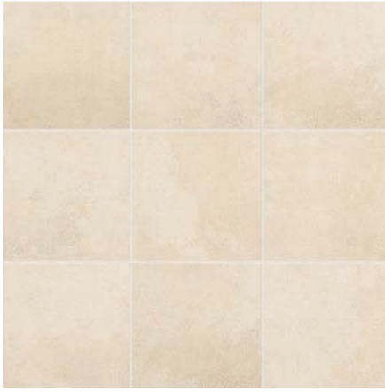
AV211 Cinema Champagne 4% pre-consumer recycled content*