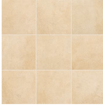
AV212 Café Caramel 4% pre-consumer recycled content*