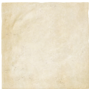
16" x 16"