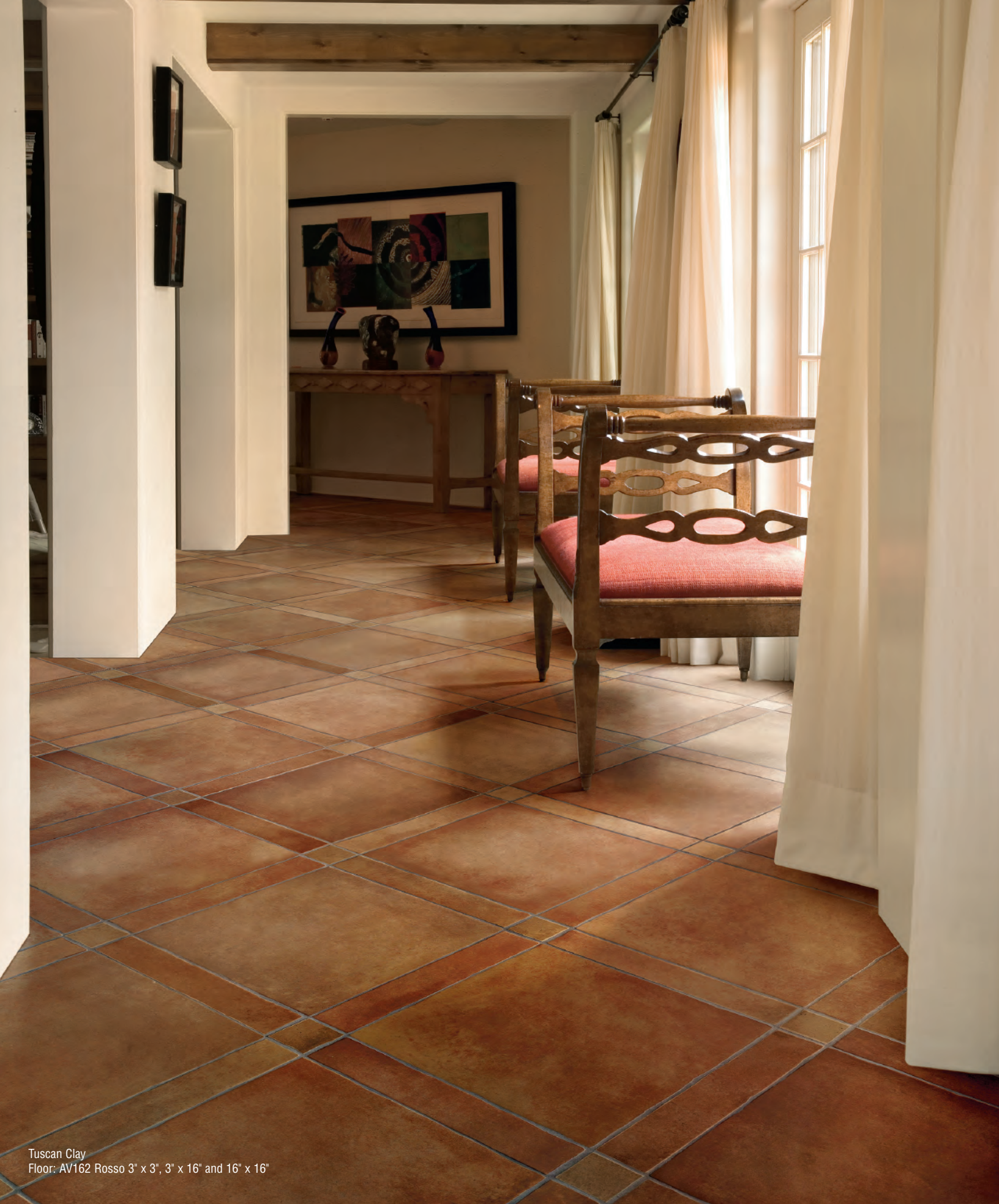
Tuscan Clay Floor: AV162 Rosso 3' x 3', 3' x 16" and 16' x 16"

Crossville, Inc. • P.O. Box 1168, Crossville, TN 38557 Phone: 931.484.2110 • Fax: 931.456.2956 E-Mail: crossc@crossvilleinc.com • crossvilleinc.com