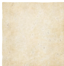
12" x 12"