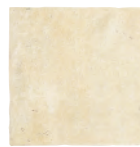
8" x 8"