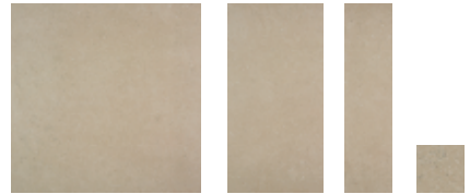
24" x 24"