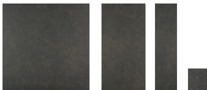
24" x 24"