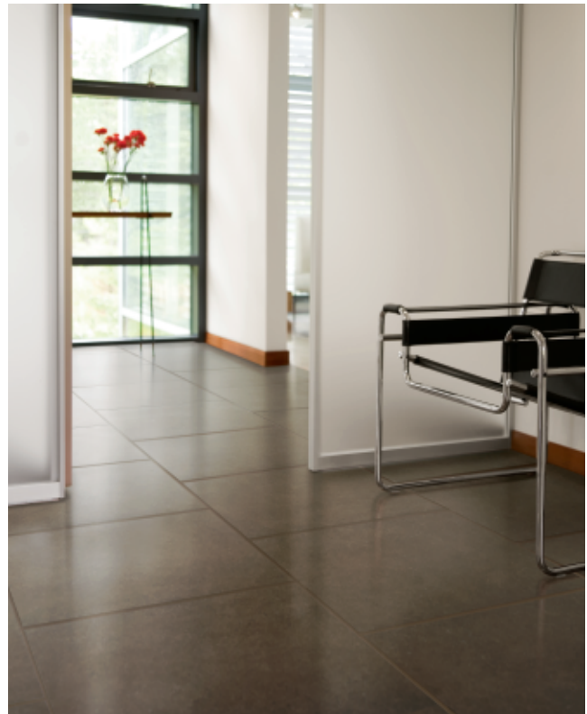
Product featured in photo above: AV224 Timber 24" x 24"