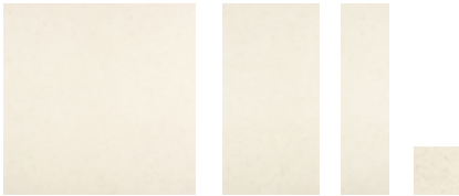
24" x 24"