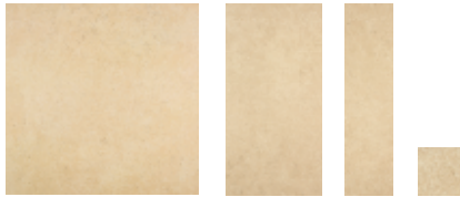
24" x 24"