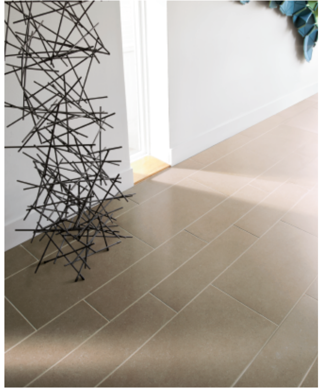
Product featured in photo: AV223 Shale 6" x 24", 12" x 24"