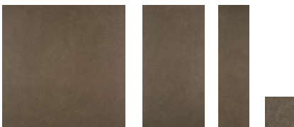
24" x 24"