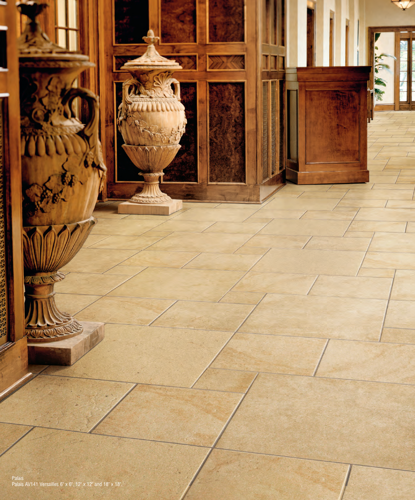
Palais Palais AV141 Versailles 6" x 6", 12" x 12" and 18" x 18".

Crossville, Inc. • P.O. Box 1168, Crossville, TN 38557 Phone: 931.484.2110 • Fax: 931.456.2956 E-Mail: crossc@crossvilleinc.com • crossvilleinc.com