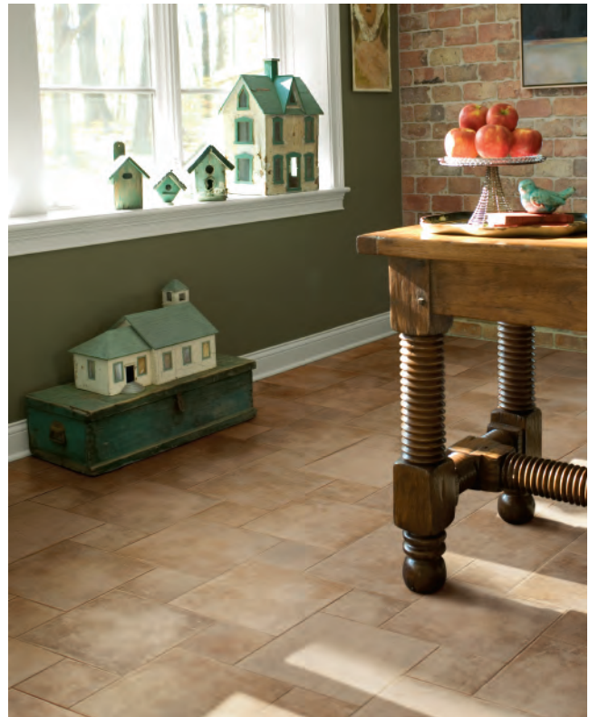
Product featured in photo: AV172 Tan 6" x 6", 12" x 12"