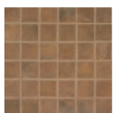
2" x 2" Mosaic