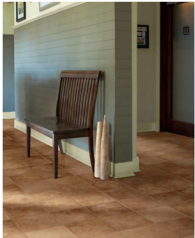
Product featured in photo above: AV173 Red 12" x 12"