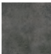
18" x 18"