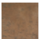
12" x 12"