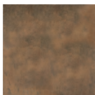
18" x 18"