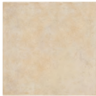
18" x 18"