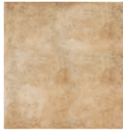
18" x 18"