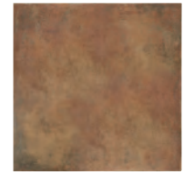
18" x 18"