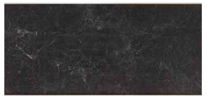
Cava Nero Greco Matte 3+ L7940