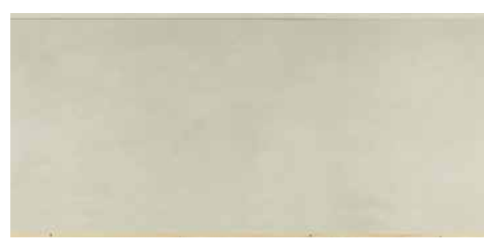
Calce > Grigio 3+ F6376

Tile panels are produced by wet grinding of clayish raw materials, granite, and metamorphic feldspar-containing rocks and ceramic pigments. They are compacted shaping in compactor, sintered at 1200° C with hybrid firing. The tile panels can be placed on top of each other or over other materials to create extremely light and particularly resistant composite and structural panels suitable in all those cases that require high resistance and reduced weight load on the surface.