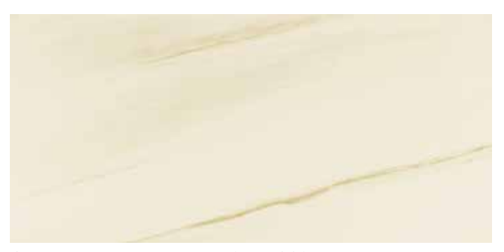
Cava Bianco Lasa Matte 3+ L7923