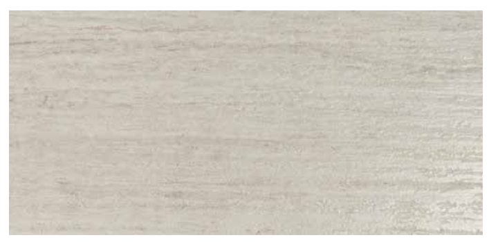
I Naturali ▶ Ossidiana Vena Chiara 3+ L3121