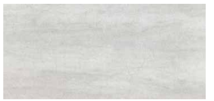
I Naturali ▶ Pietra di Savoia Perla 5.6 L5135