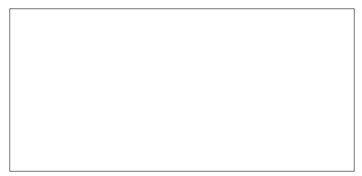
Collection ▶ Bianco Assoluto Matte 5.6 L7956