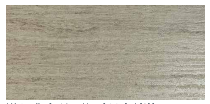
I Naturali ▶ Ossidiana Vena Grigia 3+ L3122