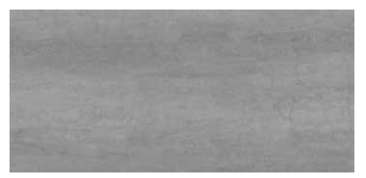
I Naturali ▶ Pietra di Savoia Grigia 5.6 L4552