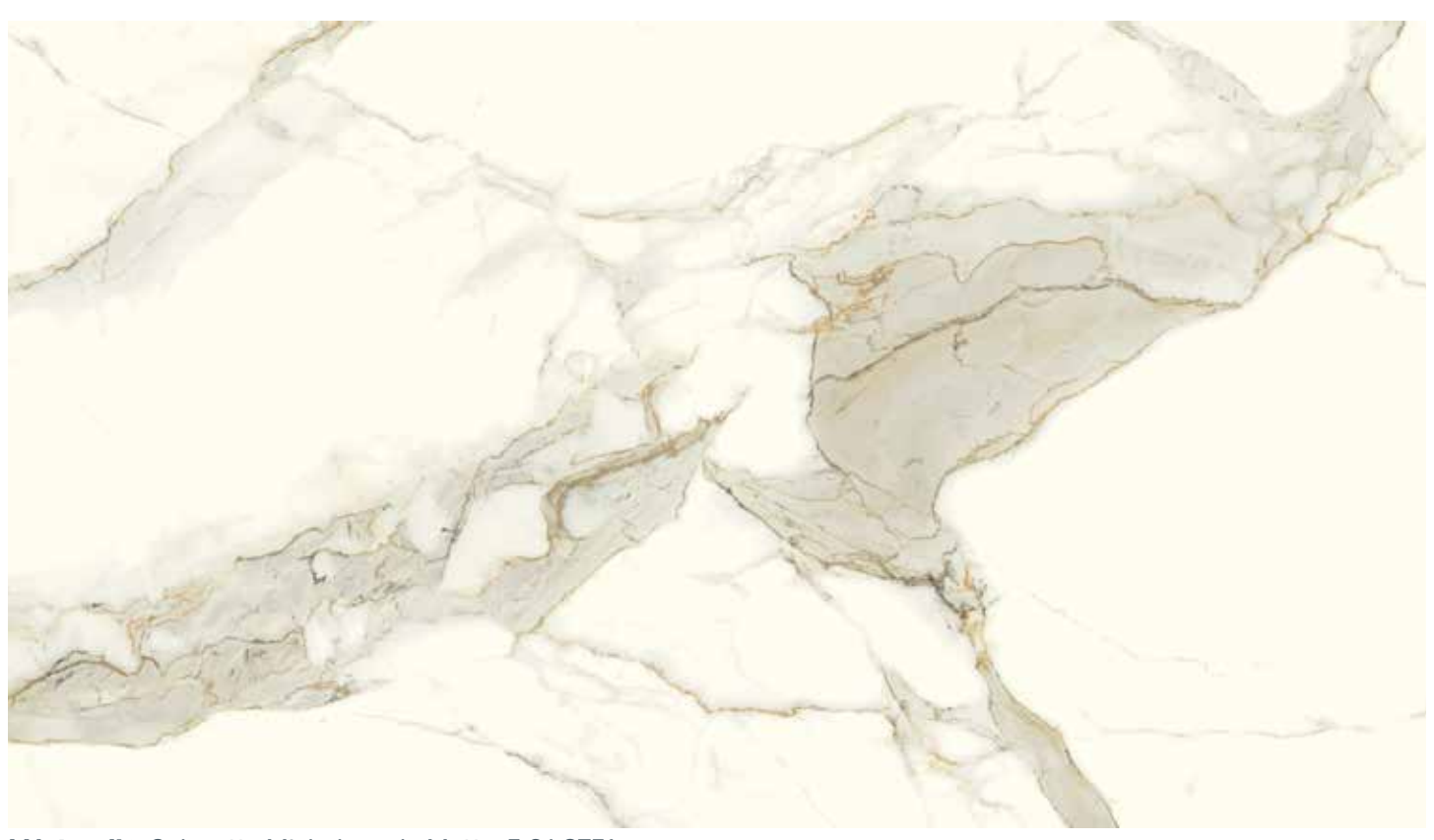
I Naturali ▶ Calacatta Michelangelo Matte 5.6 L8751